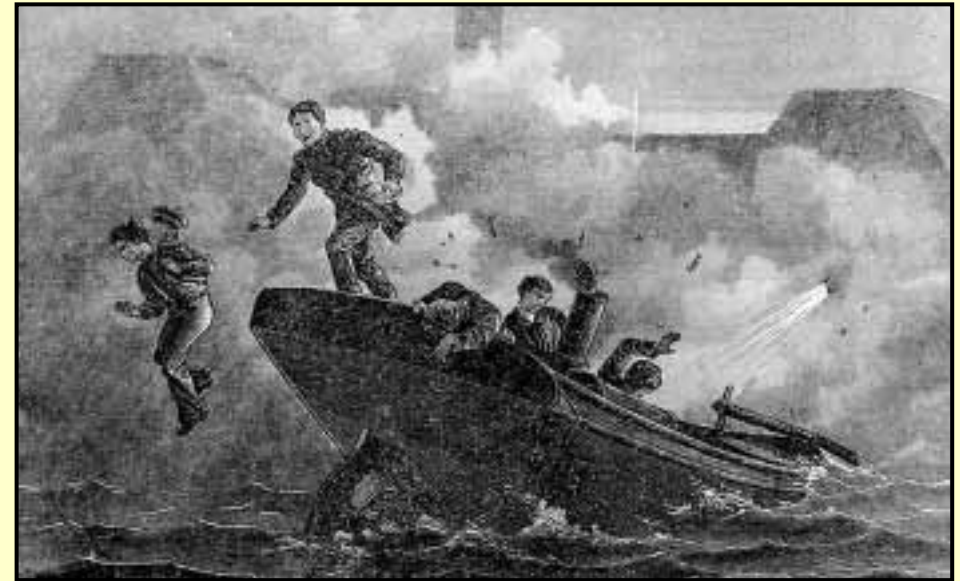
Cushing sinking the CSS Albemarle

The Confederate ironclad had been moored here in Plymouth for repair since its last engagement, and a floating log barrier protected it from torpedo attack. Late on the night of October 27, Cushing set out in his launch and, after he spotted Albemarle , decided to seize it. Before he got close enough to board, however, a dog’s bark alerted the Confederate guards, who opened fire. Cushing ordered the launch toward the ironclad at full steam. When he saw the log barrier, he rode over it, but the launch stuck instead of penetrating to the